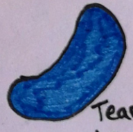
Tears of a drag queen