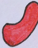
Pirate ship barnacle